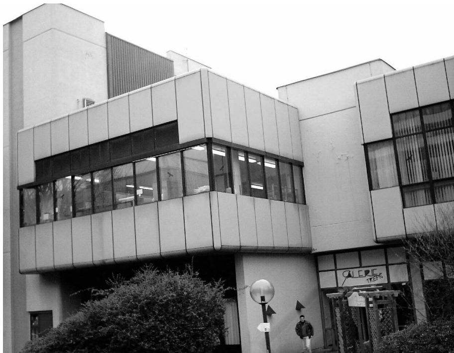
Figure 2: Example building inside the University of Dortmund, Germany.

be used to detect contradictions in the module states, and support engineers and modelling experts in correcting and modifying the system kernel. The initial rely value for new errors is kept low however, when modifying or extending the domain specific or scene specific database with new rules or semantic elements. When the same restrictions are detected again, the rely value of these rules will be evaluated and they will be considered as temporary. They will only get a continuous attribute, if their rely value ranges above a given limit which results from several analysis processes of the same occurrence. New tests may be performed within the different modules of the database, but only after precise validation by construction and modelling experts. Efficient and reliable databases are built up in this way for the domain specific and scene specific knowledge with optimal premises for analysis and synthesis within the whole modelling process. An example object is displayed in Fig. 2 and has been chosen to verify the proposed concept in the following paragraphs.