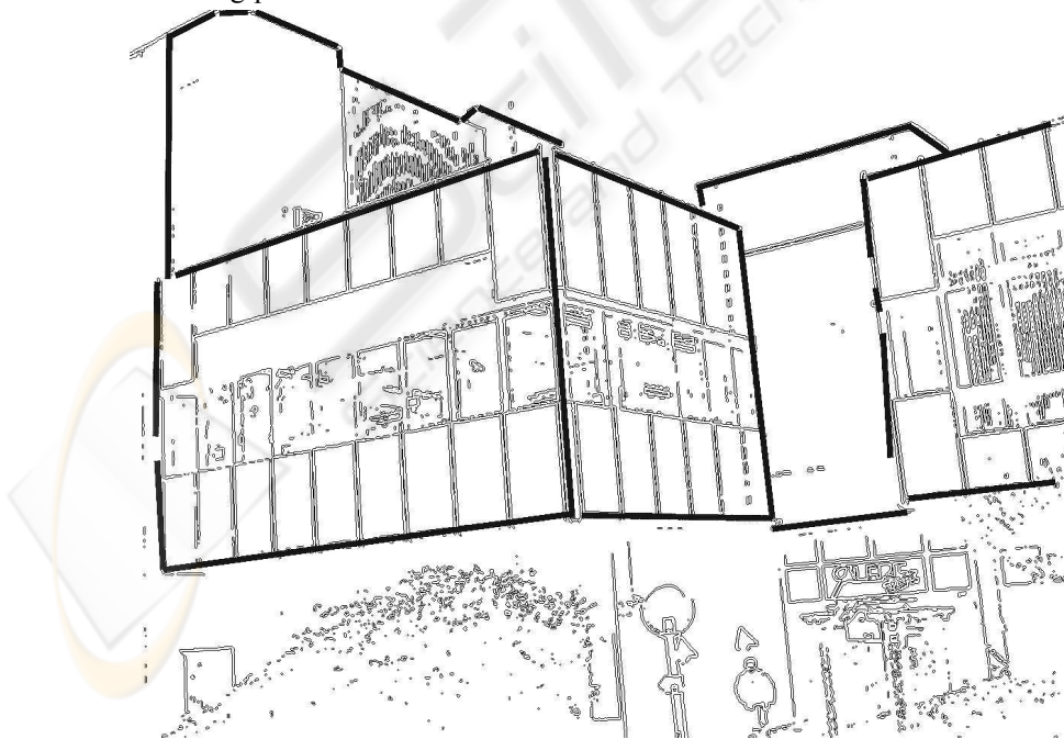
Figure 3: Result of the model primitive extraction after the knowledge refinement process

This new 3D-modelling procedure is derived from a