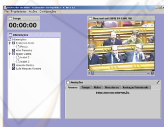
Figure 3: Video Indexing Application Interface

The application is an MDI (Multiple Document Interface) composed by four internal windows, each one with a specific functionality.