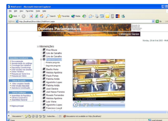
Figure 4: Web Viewer interface

The web viewer was developed using Microsoft .NET (Microsoft, 2003) programming environment. The main objective of developing the web viewer in .NET was to test the interoperability between programs built in different platforms. Figure 4 presents the interface of this part of the system.