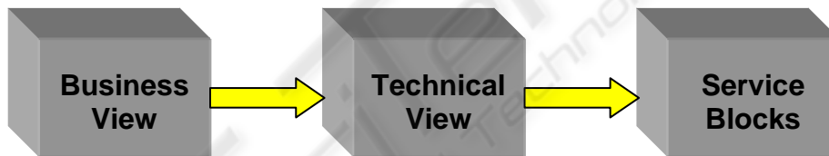
Fig. 1. Business view, technical view and derived service blocks

In order to determine the functionality needed by a business process, first of all the professional requirements (business view) must be analyzed. Based onto that the technical requirements at their implementation (technical view) are identified. Finally the needed technical functionality can be combined into architecture components (service blocks), in order to provide a uniform architecture for pervasive computing for all business processes according to the requirements (see figure 1).