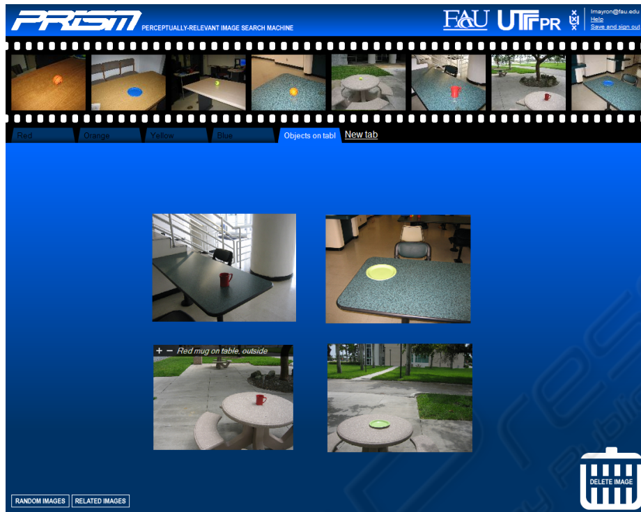
Figure 6: A representative query based on semantic annotation.

The new interface was realized using current web-based technologies. The benefits of these tools are clearly apparent, particularly in making the application portable and widely accessible.