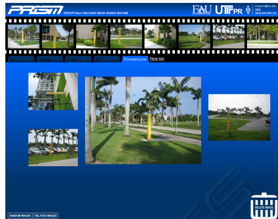
Figure 4: A representative content-based query.

Similarity is determined by the distance of the retrieved images to the query. There are a variety of possible query types in CBIR systems that include, but are not limited to, interactive browsing, visual sketch (a drawing of the intended target), query-by-example, and query-by-specification of visual features (Marques and Furht, 2002). In many systems relevance