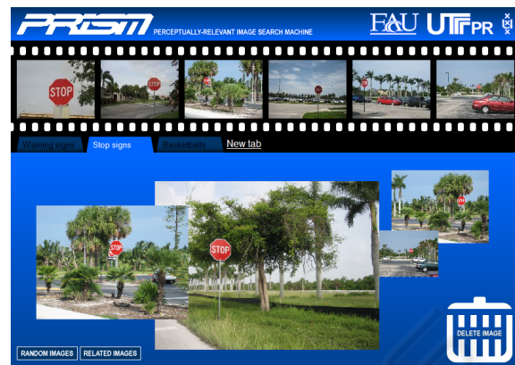
Figure 2: The PRISM interface.

Once the user has created an account, or if they are