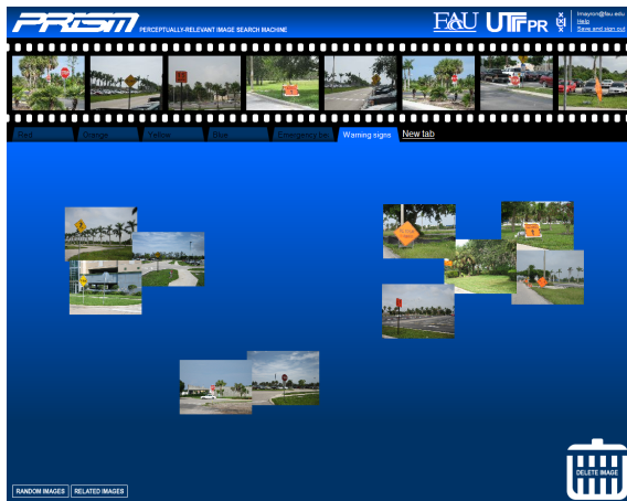
Figure 5: A representative content-free query.

are not typically considered by image retrieval applications – the general focus is on the experience of the individual user. In the case of PRISM, information from other users can be used in a content-free way to improve results. Being web-based greatly reduces the barriers for using the image retrieval system.