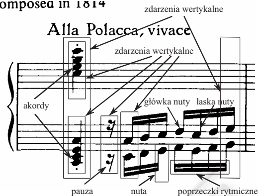
Figure 4: Structuring music notation - symbols, ensembles of symbols.

ometrical shapes that represent units of abstract data. A knowledge unit describing a staff includes such geometrical information as the placement (vertical and horizontal) of its left and right ends, staff lines thickness, the distance between staff lines, skew factor, curvature, etc. Obviously, this is a complex quantity of data.