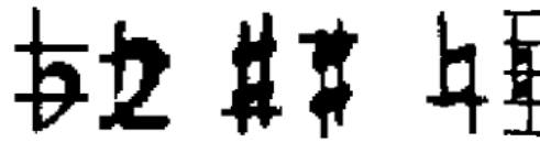
Figure 2: Printed symbols of music notation - distortions, variety of fonts.