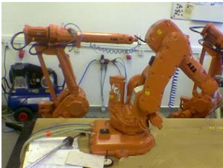
Figure 3: Robots used.

The prototype system uses a compact industrial general-purpose robotic arm (ABB IRB 140). The robot is a 6-axes machine with fast acceleration, wide working area and high payload. It is driven by a high performance industrial motion control unit (S4Cplus) which employs the RAPID programming language. The control unit offers extensive communication capabilities - FieldBus, two Ethernet channels and two RS-232 channels. The serial channel was chosen for communication between the robot and the developed control system running on a PC.