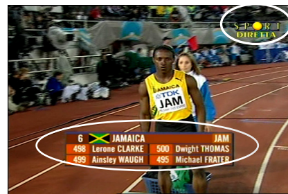
Figure 1: Example of artificial text.

The proposed algorithm (Figure. 2) exploits the fact that text lines produce strong vertical edges horizontally aligned and follow specific shape restrictions. Using edges as the prominent feature of our system gives us the opportunity to detect characters with different fonts and colours since every character present strong edges, despite its font or color, in order to be readable. An example of artificial text in a video frame is given in Figure 1.