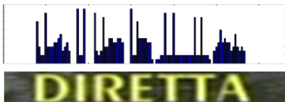
Figure 5: Example of vertical projection.