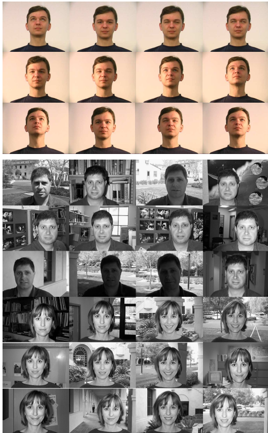
Figure 1: Uniform versus complex background: face images for a person from AltKom database and two persons from Vision database.

light conditions can be controlled. In this research we check experimentally the impact of lighting onto results of verification measured via ROC graphs.