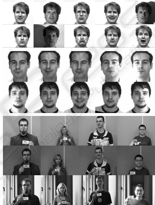
Figure 2: Face images from Yale, MPEG, and WUT databases.

Traditionally LDA model W = [w_1, \dots, w_M] is obtained from the solutions of the following generalized eigenvalue problem: