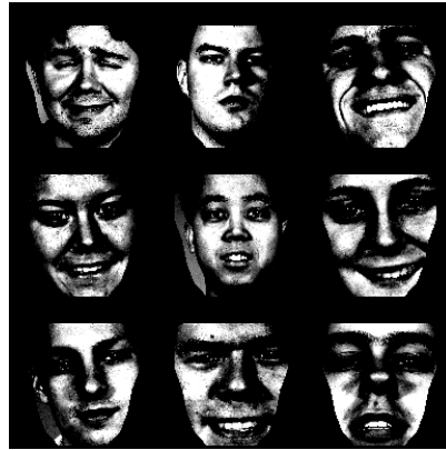
Fig. 2. Face images which have been incorrectly registered, the bottom-right image is an example of a correct alignment.

\theta_2 = (0.9, 2.5^\circ, -2.5, -2.5) , \theta_3 = (0.9, -2.5^\circ, -2.5, 2.5) and \theta_4 = (0.9, -2.5^\circ, -2.5, 2.5) , which gives us a search area around the located face region.