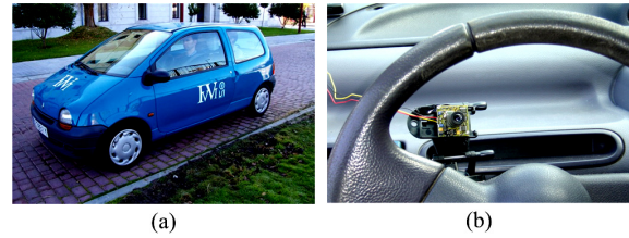
Figure 1: (a) IvvI vehicle, (b) Driver's camera.

To localize the face, this system uses VJ object detector which is a machine learning approach for visual object detection. It uses three important aspects to make an efficient object detector based on the integral image, AdaBoost technique and cascade classifier (Viola and Jones, 2001). Each one of these elements is important to process the images efficiently