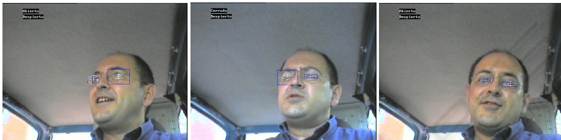
Figure 4: Different stage of the proposed algorithm on several instants of time and driving conditions.