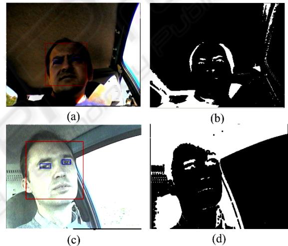
Figure 2: Face and eye detection on different drivers.

and near real-time with 90% of correct detection. A further important aspect of this method is its robustness under changing light conditions. However, in spite of the above-mentioned, its principal disadvantage is that it can not extrapolate and does not work appropriately when the face is not in front of the camera axis. Such would be the case when the driver moves his/her head; however, this shortcoming will be analyzed later on.