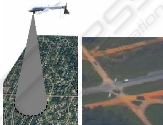
Figure 5: UAV camera field of view (left) and sample image (right) (Arrambel et al, 2004).

The Global Vision System of the RoboCup Small Size Soccer is very similar to the satellite imaging and surveillance aircraft image systems, where the images are collected from a point high above the ground, resulting in a practically 2D image. The image processing algorithms used in the Small Size Soccer League to track multiple fast moving objects can be used in satellite tracking and with aerial video. Figure 5 shows a unmanned aircraft vehicle with its camera field of view and a sample image.