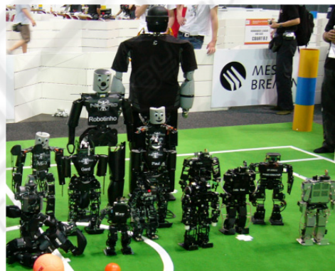
Figure 1: Robots of the Humanoid Soccer League at the RoboCup Championship - Bremen2006.

In the RoboCup Humanoid Soccer League, autonomous robots with a human-like body plan and human-like senses play soccer against each other. In addition to soccer games, penalty kick competitions and technical challenges take place. Dynamic walking, running, and kicking the ball while maintaining balance, visual perception of the ball, other players, and the field, self-localization and team play are among the many research issues investigated in the Humanoid League (RoboCup Humanoid League, 2007). Figure 1 shows some of the Humanoid Robots which participated in the RoboCup 2006 at Bremen.