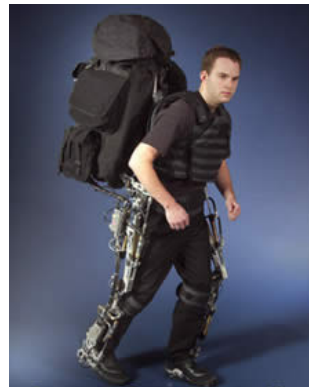
Figure 4: The Berkeley Lower Extremity Exoskeleton - BLEEX.

Exoskeletons or orthosis, like ankle-foot orthosis (Agrawal, 2005), (Ferris, 2005) may also be used in the rehabilitation of patients and help in physiotherapy.