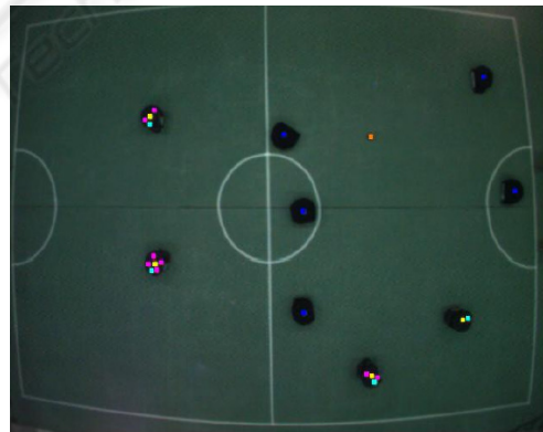
Figure 3: Typical Small Size image (Manzuri-Shalmani et al, 2006).