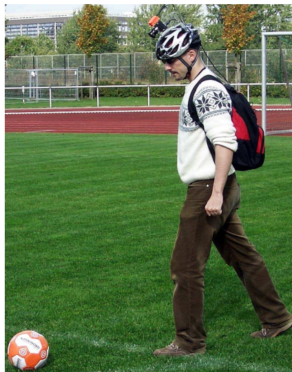
Figure 2: Our proposed experiment: Mount a camera and an inertial sensor on the head of a human soccer player and use them to extract all the information, a humanoid soccer robot would need to take the human's place.