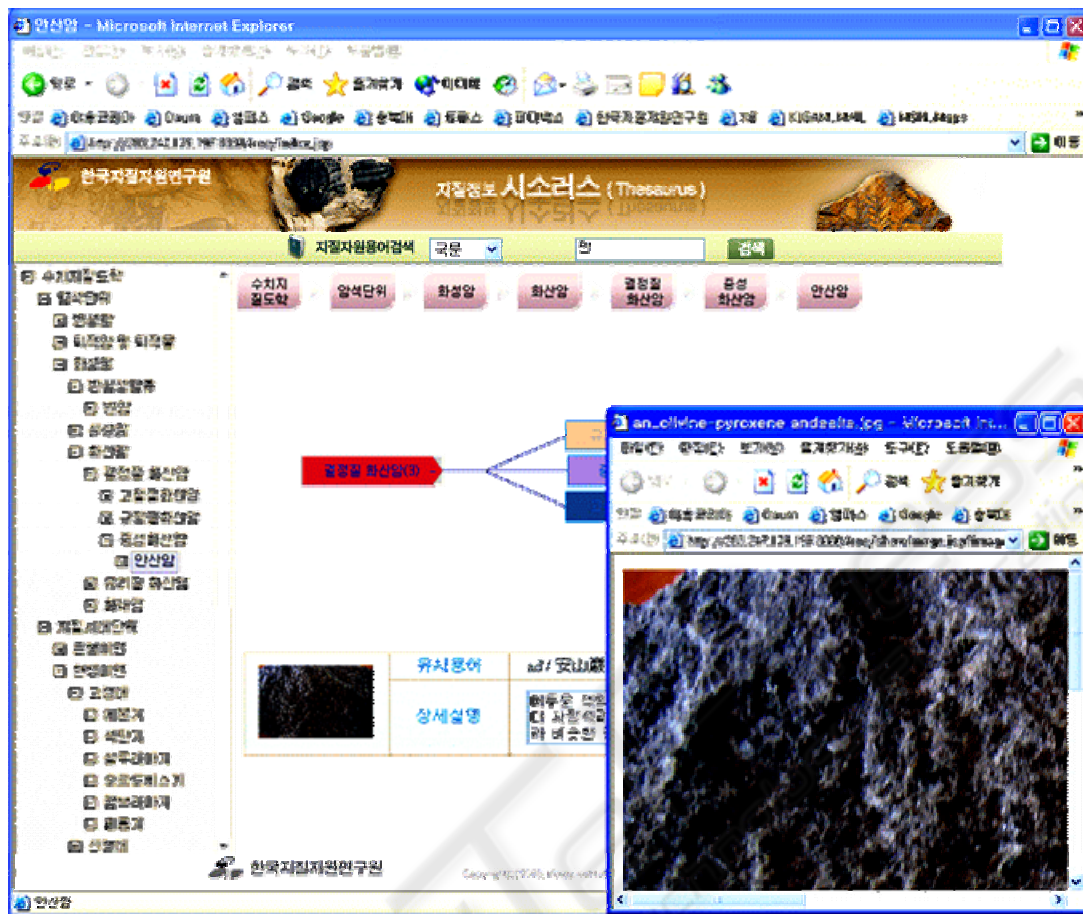
Figure 4: Image service for Geologic terms.

search services have provided information limited to users' knowledge, the present geological term thesaurus provides broad information in graphics including the location and interrelation of information, upgrading information to the level of knowledge. However, the geological term tree will be designed through long-term deliberation of opinions from many specialists in geology so that it becomes most reasonable and highly accessible through the Internet.