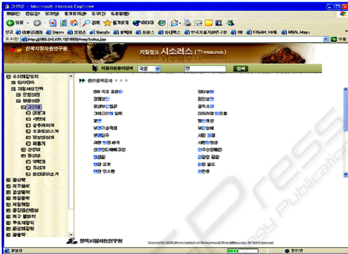
Figure 3: Retrieving terms with Korean, English and Chinese fields.