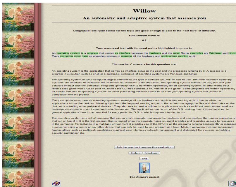
Figure 1: A snapshot of a generated feedback page.