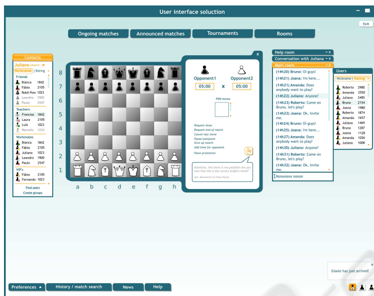
Figure 1: Interface and interactive environment solution for the project's chess server.