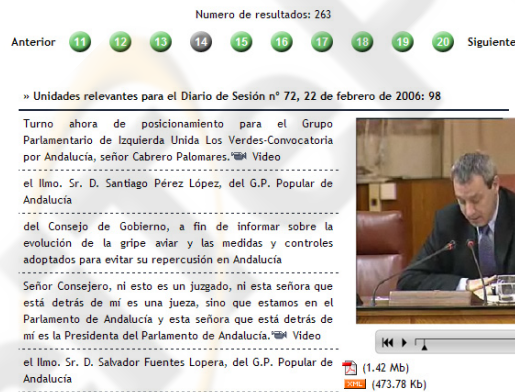
Fig. 6. Results of a query.

Once, the search engine has computed the relevance degree of the structural units of the collection, the results are presented in a second web page in groups of ten. For each result, it is provided a brief portion of the text of the structural unit, a link to the corresponding PDF document that contains this unit, a link to the XML document displayed