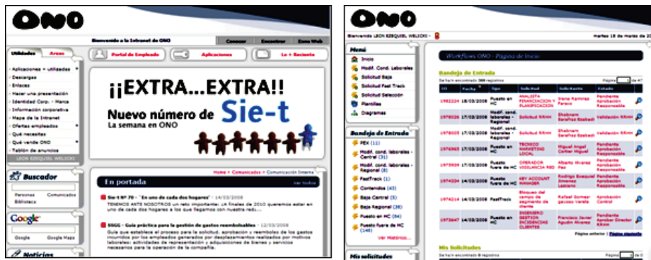
Fig. 7. UI consistency and simplicity: the HR Workflow System (right side of the figure) is similar to the corporate intranet (left side of the figure).