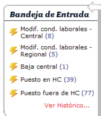
Fig. 4. Inbox summary. This widget is displayed in the left menu bar of the screen and is always visible. This widget shows the total number of requests of each type that require the participation of the logged user. When the user clicks in any of the request types the complete inbox is displayed.

Automatic Reporting. The system generates automatically the necessary reports for HR control and for the upper management control. They are generated dynamically and can be requested at any moment providing an up-to-date picture of the overall active employee life-cycle processes in the organization.