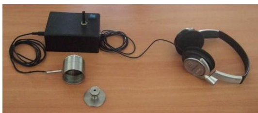
Figure 1: Lab prototype of an electronically enhanced stethoscope.

ing the development of digital and electronic stethoscopes. Bredesen and Schmerler (Bredesen and Schmerler, 1991) have patented an “intelligent stethoscope” designed for performing auscultation and for automatically diagnosing abnormalities by comparing digitized sounds to reference templates using a signature analysis technique. Several other electronically enhanced and digital stethoscopes have been developed and described in literature (F. L. Hedayioglu, 2007; M.E. Tavel and Shander, 1994; Durand and Pibarot, 1995; Brusco and Nazeran, 2005).