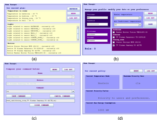
Figure 7: Some screenshots of HomeManager: a) policy-management interface, b) profile-management interface, c) command interface and d) current-policy interface.

In order to obtain the best balancing among these requirements, the methodology should support the design of suitable coordination models so that the agents can collaborate and fulfil the house control task. As highlighted in Subsection 3.2, mediated coordination seems the best solution for this kind of application. This choice leads to structure the design of interactions and coordination rules in a specific way, yet without imposing any specific “architecture” for the system. In particular, the model considers a “coor-