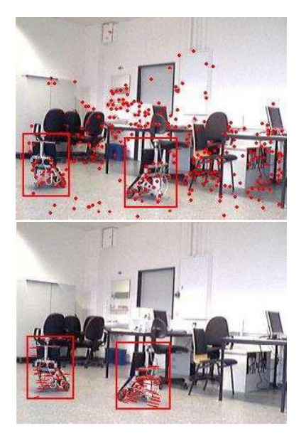
Figure 2: Tracking of moving objects in the scene.

Figure 2 shows how two robots have been tracked. The upper and lower pictures show images taken from the same camera at timestamps t and t+1 respectively. First based on the background subtraction method the robots have been found and then by using the connected components algorithm rectangles around these robots have been computed. Simultaneously, distinctive features have been extracted and tracked over these two images. In the upper image those features are depicted through dots. Computed rectangles were used to select features which represent the moving objects. Corresponding rectangles in two consecutive images have been identified through corresponding features which lie inside those rectangles. The short lines on moving objects in the lower image depict trajectories of successfully tracked features which have been found on the robots. This