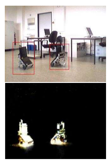
Figure 1: Results of the background subtraction.

the scene was learned from the first 200 images taken from that camera. Moving objects in the scene were then detected by the deviation of pixel colors from the background model. As shown in the lower image all moving objects have been successfully detected.