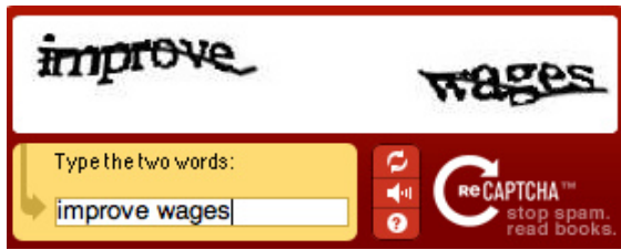
Figure 3: reCAPTCHA.

of human participants in order to generate the rules of an agent such as in an ABS (such as the helicopter agents in Abbeel, 2008). In addition, since these rules are extracted from real-time decisions that human participants make in response to complex environments, an ABS that is built upon the results of a PS will be more robust than a simulation that was hand-engineered. In this way, we can use the PS to develop a better ABS using modern AI methods.