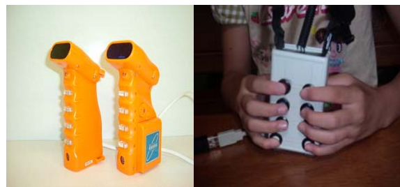
Figure 3: The "YUBITUKYIs" (Left:Ver.1, Right: Ver.2).

The users of the "YUBITUKYI" system able to transmit their communicating information signals to their companies, and they can send those signals to strike 1-6 vibrating points of the "YUBITUKYI" terminals. As the "YUBITSUKYIs" are portable terminals and the "YUBITUKYI" system has some optional functions, for instance, a REPEATER TAG function, a BROADCASTY function etc, they can walk and use the system carrying them and can receive the telegram message of Braille from the