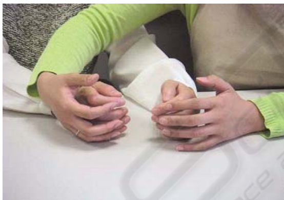
Figure 2: The Finger Braille.

The data of the "YUBITUKYI" can be collected with electric methods and its data processing are able to be performed with electrical techniques and their transformed data are too able to be used for analysis of the information structure.