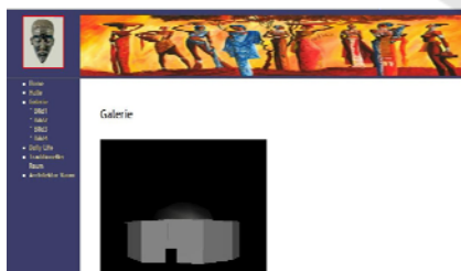
Figure 4: Metadata visualization (Entrance hall).