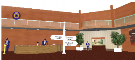
Figure 2: Grassland museum (3D entrance hall).

The feasibility of our concept was demonstrated by using an existing implementation of an African Grassland museum (Mafo, 2007) that includes an entrance hall and a separate hall for exhibits on the topic of daily life (cf. Figures 2 and 3). The system architecture consists of a PHP-capable Web server, a MySQL database server and Altova XML Spy and a Web browser as the client-sided interfaces. The object descriptions are stored in the database. Data is read and written through an ODBC connection. The Web-based metadata and object visualization front-end lists several objects in a selection list. When an object is clicked, it is visualized, and several metadata can be displayed (Figure 4).