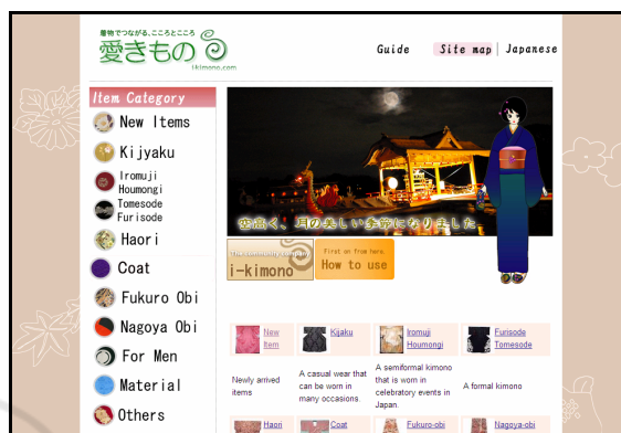
Figure 5: Screenshot i-kimono.

i-kimono also provides the e-kimono NPO Support Program. Many grants for nonprofit organisations don't cover administrative costs. Therefore, many Japanese nonprofits repeatedly experience cash flow problem. To break through such a problem, i-kimono provide civic groups with proceeds from their internet charity auction.