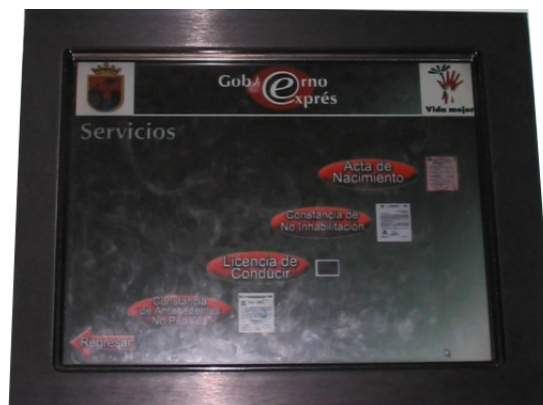
Figure 2: Screenshot ATM Express Government.

the users, dispenser of Vehicle's plates, collection device that receives and gives change in bills and coins of any denomination and detect damaged or false bills and much more. In total, the Express Government ATMs offer 59 fully automated services to the common citizen.