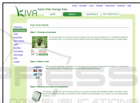
Figure 4: Screenshot KIVA Micro Finance.

Furthermore, Kiva will author a client side desktop application that MFIs can use to communicate with the Kiva.org website. Because the application sits on the desktop, partners can use it without being constantly connected to the Internet. In a dial-up environment where page loads take 20 seconds, this vastly improves efficiency.