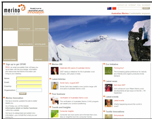
Figure 6: Screenshot the Merino Innovation Portal.