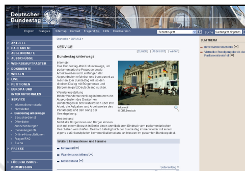
Figure 3: Screenshot Lower House of German Parliament.

Another section covers history, providing in depth information about previous legislation periods of the Lower House's history as well as parliamentary history in Germany. All this information is structured thematically.