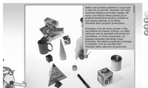
Figure 5: Menu buttons on the right and the instruction for the teacher.

After introductory video teacher can use exercises that are offered in Matko. Figure 7 shows some of these exercises where pupils classify and sort objects, search for objects behind curtain, play the memory game, search and name the objects.