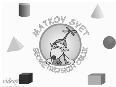
Figure 3: Main screen of Matko's world of geometric shapes.

As a must have feature according to (Bandoh, 2000) in the main menu (figure 4) teacher can select different scenarios: classification of geometric objects, cube, block, sphere, cylinder, cone and pyramid.