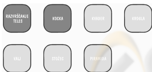
Figure 4: Main menu.

Teacher can always come back to the main menu by using buttons on the right side of the screen (figure 5). Each scenario has the instructions for the teacher, like the one shown upper right on figure 5. It is shown on the demand and teacher can choose to use it or not. Each scenario also has a video showing real objects that introduce pupils to learning subject. Figure 6 shows a screenshot from the video where Matko classify objects based on their shapes.