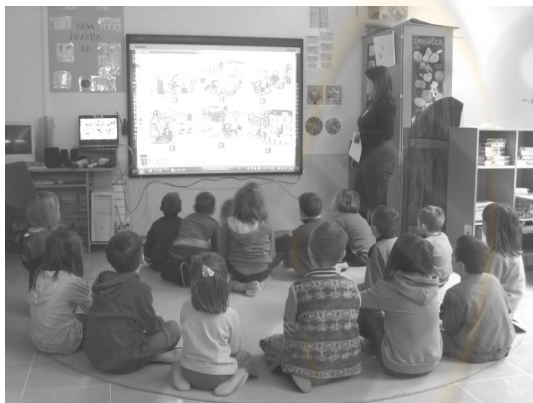
Figure 1: IWB and frontal work.

As other technologies the IWBs are also prone to some drawbacks. Mostly we experienced the following ones: calibrating, limited collaboration, pupils left aside, contact sensitivity, electricity problems, and sharing resources.