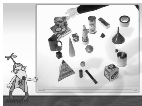
Figure 6: Accompanying video.