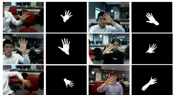
Figure 3: Evaluation of the sensitivity of our hand segmentation algorithm to different backgrounds and skin colours.

Section 3 described our region growing algorithm and explained that the testing of candidate pixels is performed by computing their colour distance to the mean colour of the current hand segment. An alternative application is to only consider the neighbours of the candidate pixels which are within the segmented region. We found that using the mean constraint results in better segmentation for the wrist region, but causes one artifact in the finger region. Overall we