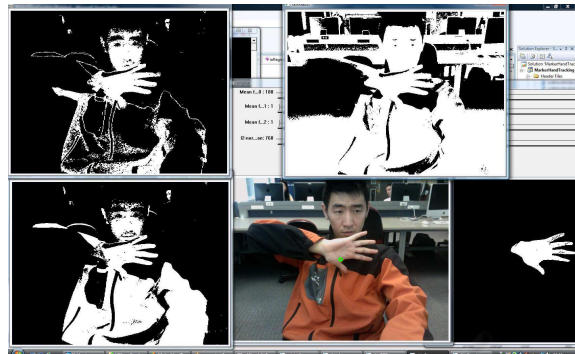
Figure 1: Comparison of the hand detection and segmentation results using our region growing technique (bottom-right) and the skin classifiers from (Hsu et al., 2002) (top-left), (Yang et al., 1998; Stauffer and Grimson, 1999) (top-right) and (Kovac et al., 2003) (bottom-left).

Figure 3 (right) demonstrates the robustness of our algorithm when applied to different skin colours.