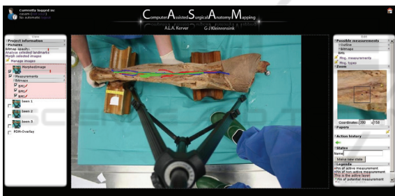
Figure 4: The web-interface work-area for researchers.

After selecting a project the main work area is shown where the user can view and edit (only when permitted) existing data or add new data (figure 4). Implemented features include: