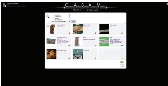
Figure 3: The project selection screen in the web interface.

Our software enables users to do their work in an efficient and intuitive manner. After log-in the user is presented with available projects (figure 3).