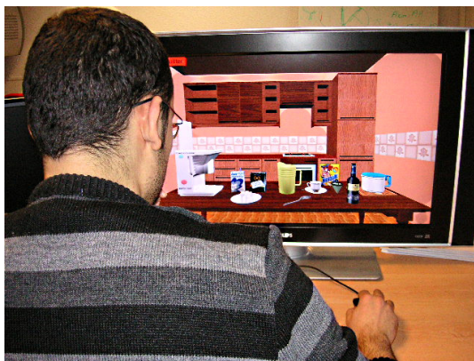
Figure 5: Subject performing the task in the more complex configuration.

diagnostic criteria of Alzheimer's disease and is associated with numerous serious consequences. The aim of this study was to examine the value of the previously described virtual kitchen to detect disturbances in activities of daily life in Alzheimer's disease through the task of preparing a cup of coffee with a coffee machine.