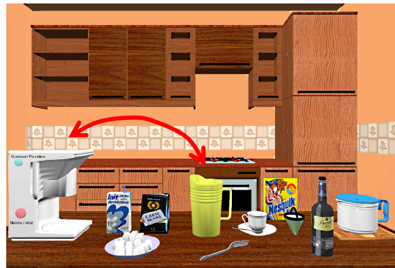
Figure 4: Snapshot of the complex configuration of the kitchen with additional distractor objects.