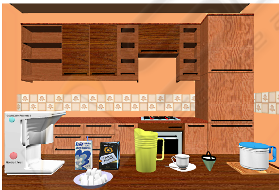
Figure 3: Snapshot of the complex configuration of the kitchen: interacting virtual objects are put away from each other.