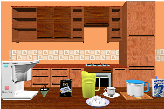
Figure 1: Snapshot of the basic virtual kitchen configuration: the virtual objects are arranged in the order that they should be used.