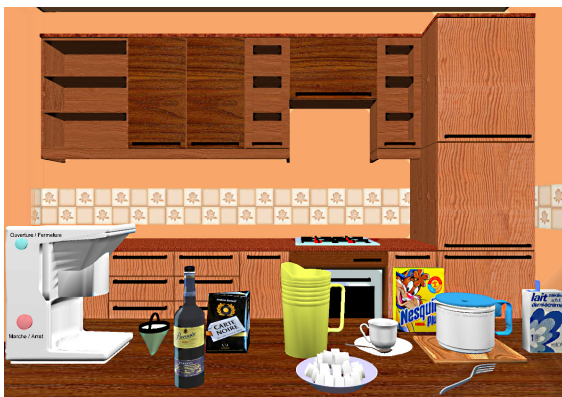
Figure 2: Snapshot of the basic kitchen configuration with distractor objects (chocolate box, fork, and bottle of wine).