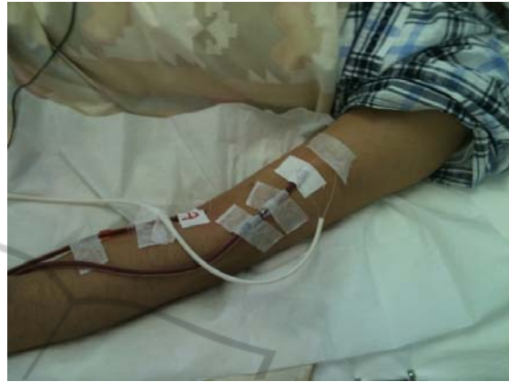
Figure 3: Clinical setting during hemodialysis. The optical fiber was attached with 3M tape to the skin and partially passed through a white tube.

used as a disposable sensor to quickly detect bleeding and leakage during hemodialysis and continuous venous infusion.