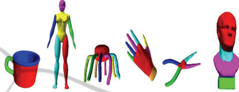
Figure 2: Some ground-truth segmented models.

six classes (varied objects, Human, Animals, Hand, CAD and Bust), containing each one seven models. We selected this set of meshes and its corresponding ground-truth (figure2) from the benchmark (Chen et al., 2009). We have selected secondly eight 3D mesh segmentation methods (Table1). To make our choice, we have mainly focused on recent works. Moreover, we favoured approaches that adopt a semantic segmentation (part segmentation methods).