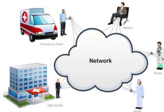
Figure 1: Business use case.

An e-UMIHealth domain controller is a caregiver centre. It is the entity in the network that manages the e-HealthDroid devices. A key aspect of the management is the definition of the users' profiles. These define categories of users that have different access to the data, such as medical doctors, nurses or other personnel. The e-HealthDroid device is a smartphone based on the Android OS that implements our software stack. Through its application-programing interface (API), it provides a bridge to its associated bio-signal device. In this sense it works as server for the sensors' data acquired by the bio-signal device. The bio-signal device is the sensing element that acquires the several biological signals. A bio-signal device is also called a secondary entity, since its sensors' data is only accessible through an e-HealthDroid device. An e-HealthDroid device may have no bio-signal device associated to it, but be used to inquire data on another e-HealthDroid device (server). The e-UMIHealth domain controller and the e-HealthDroid device are also called primary entities, since they interact directly among them.