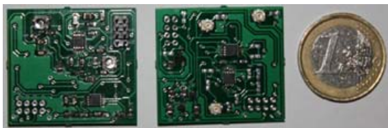
Figure 3: Physiological acquisition device.

In addition to the developed software, and for test purposes, it is also required to implement an acquisition system able to be worn by users. One solution is to develop regular clothes with the acquisition devices directly embedded. The other is to develop small enough devices to be hidden in regular clothes, with the ability to record the required signals. Figure 3 shows the available device used for signals recording ( bio-signal device ).