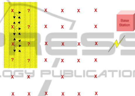
Figure 3: Topology of a faulty sensor field.

Figure 1 illustrates what an uniform WSN topology might be expected to look like. Sensors are laid out in the coverage area in a grid-like fashion, all equidistant such that the entire area is covered from a sensing and routing perspective. Each sensor has a number of paths for routing data to the base station,