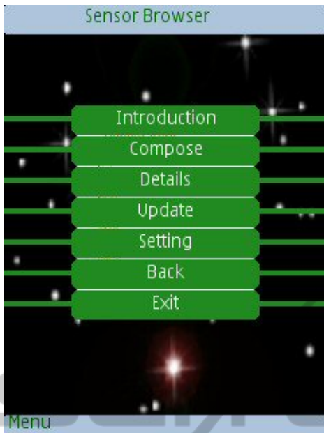
Figure 4: Sensor Browser: introduction screen.

and smart phones increasingly incorporate a suite of technologies that enables them to host specialized third-party and custom-developed applications. In this case, a Nokia N97 was harnessed.