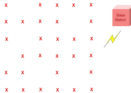
Figure 2: Topology of a realistic sensor field.

des by issuing a multi-hop request. Using an embedded compass for orientation, and a signal strength indicator for position, it can be used in a point-and-browse fashion while physically in the WSN. Tri-corder is designed to operate with the Plug sensor network. Such a network has potential in domestic or occupational environments; however, it is not suitable for wide area sensor networks of the kind used for environmental monitoring. Ringwald et al (Ringwald et al., 2006) have developed a tool for interactively inspecting WSNs in the field. It allows querying of individual nodes and firmware upgrades on the nodes as well as topology viewing. Extensive use is made of Bluetooth, even at sensor level.