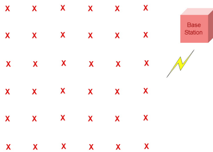
Figure 1: Topology of a ideal sensor field.