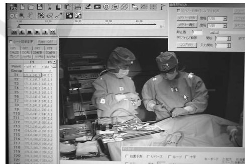
Figure 1: SNR intraoperative scene. (Miyawaki et al., 2005)

A scrub nurse must hand a surgical instrument to a surgeon as soon as it is requested. If the scrub nurse