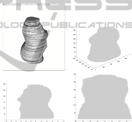
Figure 2: Different views of a prototype.

pometric measurements is selected, their 3D "mean shape" is a valuable information for apparel industry. Our contribution in this work has been to build this 3D "mean shape". From 2D cross sections of these 3D aligned shapes, we have computed the sample (Baddeley - Molchanov) mean of each homological section. The 3D reconstruction of these 2D means allows us to obtain the desired prototype. In our opinion, to average the 2D homologous sections has allowed us to build prototypes that reproduce in a quite accurate way the shape (and proportions) of the woman's body. Our aim for future works is to work directly with the 3D volumes to obtain 3D "mean shapes".