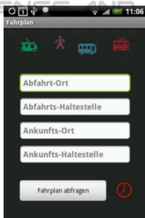
Figure 1: Auto-complete view.

The user interface of the application has been improved iteratively. In the following we discuss the most notable steps in designing the user interface. We started with a Spinner layout and improved this design incrementally. This new view also (in case of a successful route request) automatically adds the entered entry into a list, which automatically suggests this location or station when the first letters are entered (Figure 1).