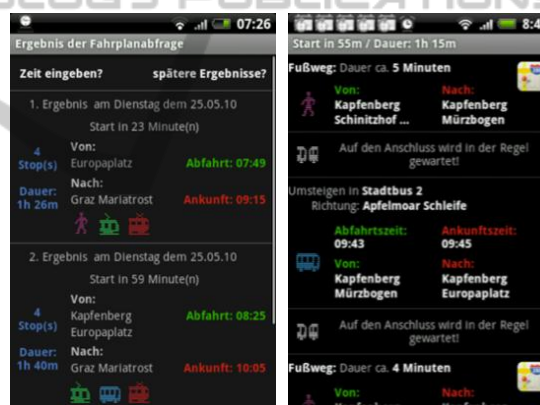
Figure 2: Results pages.

the System Usability Scale (SUS) was performed (Brooke et al., 1996). This is a simple and short, 10 question based survey, which asks the users about their general feelings about the application (complex, cumbersome, easy to use etc.). The SUS test can also be used to review systems, webpages and mobile systems, see e.g. (Holzinger et al., 2011). The user questionnaire consists of 10 questions, where odd-numbered items worded positively and even-numbered items worded negatively. The questions are as follows: