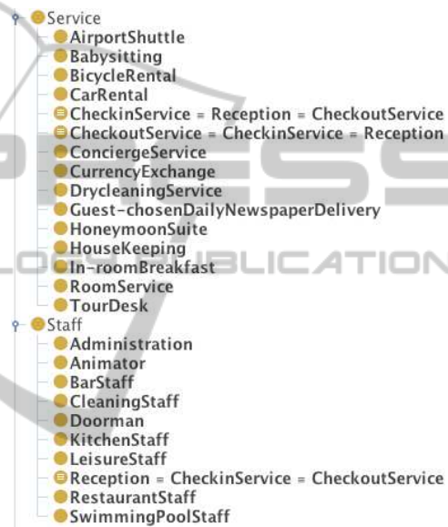
Figure 2: Representation of Service and Staff in Hontology.

sented as concepts in Hontology, e.g. with Balcony and with Sea View .