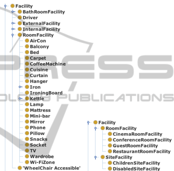
Figure 4: Representation of the concept Facility in Hontology (left) and in QALL-ME (right).

Hontology contains 282 concepts categorized into 16 top-level concepts. The concept hierarchy has a maximum depth of 5. Table 3 presents some metrics about Hontology. It is worth mentioning that all concepts and properties are defined in English, Portuguese, Spanish and French. Along the development of this ontology, we observe that Hontology contains the following qualities: i) indefinite expandability, since it remains consistent with increasing content. ii) content and context independence, since any kind of concept can find its place and iii) specify different levels of granularity (levels range from 1 to 5 – see an example in Figure 1).