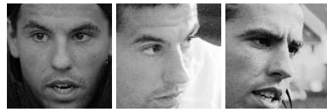
Figure 2: Examples of the faces with 2, 1 and 0 detected eyes (from left to right).

We utilize a neural network of the type Multi-Layer Perceptron (MLP) as an implementation of the classifier due to its simplicity and our know-how in this field. It is trained on manually selected sub-set of faces (50 examples) and non-faces (50 examples). The MLP topology has 3 layers: 256 input nodes (each input corresponds to one intensity value in the grayscale picture), 10 neurons in the hidden layer and two output nodes: F \times NF classes. In order to evaluate the accuracy of this classifier, we chosen randomly 100 examples from each class and we verify them manually. The face \times non-face classifier's accuracy is about 87% which is enough for our further experiments.