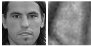
Figure 1: Example of one correctly detected face (left) and one incorrectly detected face by the Viola-Jones face detector.

a face corpus as most automatically as possible: