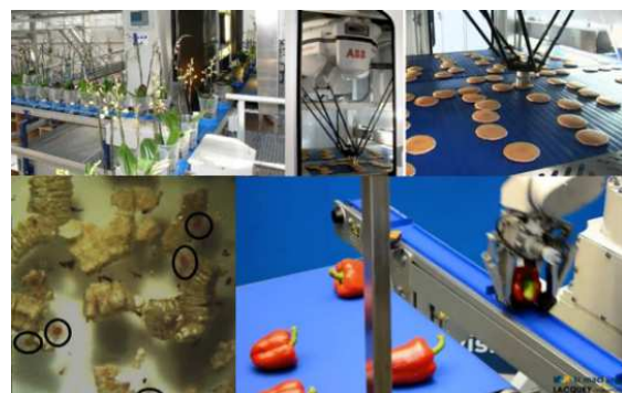
Figure 2: Examples of industrial object categorization applications: robot picking and object counting of natural products.