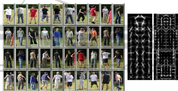
Figure 3: Example of (LEFT) intra-class variability and (RIGHT) an object class model for detecting pedestrians.

In this position paper we will focus on the scene variations that are presented in Table 1 as degrees of freedom. When applying this e.g. to detecting