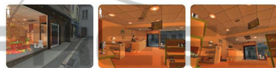
Figure 2: Virtual Kid demonstrator.

The material used to collect data regarding the process of the functionalities selection and prioritization was a questionnaire. The questionnaire contained a list of functionalities of Appli-Viz’3D that users had to prioritize (Table 1 – white part). These functions were taken up from a previous demonstrator named ‘Virtual Kid’ (see Figure 2) - an online store that helped to launch the project ‘3D Child’. This questionnaire was elaborated by non-engineer designers, because we thought a priori that the designer-engineer would restrict at once the range of possibilities.