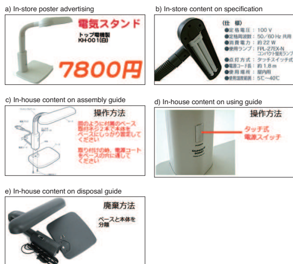
Figure 3: Digital signage for supporting appliance.

When the light was bought and transferred to buyer's house, a container, which was attached to the counterpart through the follow connector and had an application-specific component inside it, migrated to a computer in the house and provided instructions on how it should be assembled. Figure 3 c) has the active content for advice on assembly. The component also advised how it was to be used as shown in Fig. 3 d). When it was disposed of, the component presented its active content to give advice on disposal. Figure 3 e) illustrates how the appliance was to be disposed of.