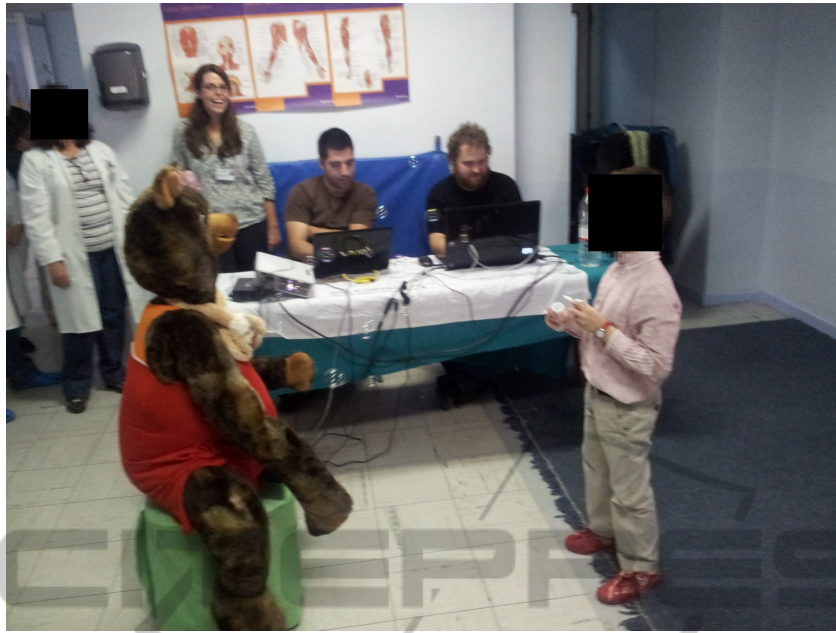
Figure 5: Ursus interacting with a child.

ences, designing new interactive AR games specifically aimed at generating therapeutic movements while providing a stimulating and joyful experience. Finally, during the sessions, the robot will register all movements made by the child and will compare these movements with the normalized patterns defined by the physicians. The computed difference should be used to generate on-line reinforcement verbally synthesized discourses and expressions. It is important to consider that, despite we have presented a rather simple scenario, the complexity of keeping the child's attention during twenty minutes each session and during tens of sessions, is daunting. Only a well designed robot with a suitable cognitive architecture and the knowledge of trained clinicians provides the necessary material to pursue this kind of research.