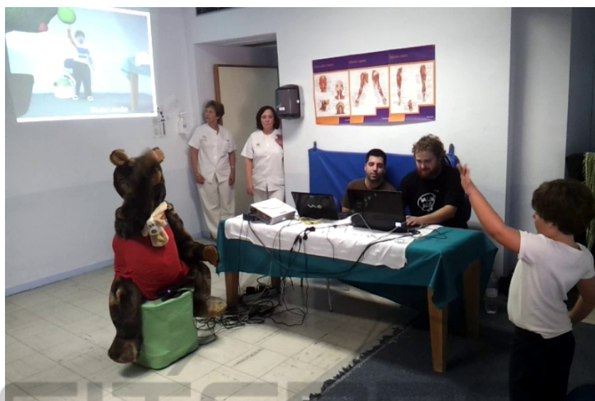
Figure 3: Ursus, patient and AR-based serious game in action. The picture was taken at the Hospital Virgen del Rocío (Seville, Spain) and provides a good snapshot of the sessions with real patients.