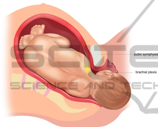
Figure 1: Shoulder dystocia.

time per week. Also, it must be noted that the degree of affectation of each patient is very different according to both the seriousness of the disease and the bodily functions affected, so it is essential that rehabilitation sessions will be personalised. However, the conventional rehabilitation treatment for these pathologies is usually based on the repetition of a set of tedious exercises. This is a problem for paediatric patients due to their young age, as they would prefer doing fun exercises instead of repeating the same movements for twenty minutes. The resulting loss of motivation can be a serious obstacle for the therapy.