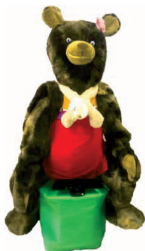
Figure 2: Ursus: a robotic platform for neuro-rehabilitation therapies.

Although we could use the capacity of the OpenNI library for tracking human bodies, we have integrated this ability within a model-based approach for human motion capture. We provide some results on Section 3 (see (Calderita et al., 2013) for further details). The aim is to employ the chest or the torso of the child like a visual landmark of augmented reality. Then, we build a virtual scenario around the child for each rehabilitation session (see Section 2.2 for further details about the games). As we a priori knows the profile of the patient, each game can be easily customizable.