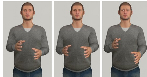
Figure 2: The same sign with different emotions. From left to right: neutral, angry and sad.

Thus, the final result is the virtual interpreter signing with very realistic movements. The execution of the signs, as well as facial expression, is modified depending on the emotion. Figure 2 shows the same sign executed with different emotions.