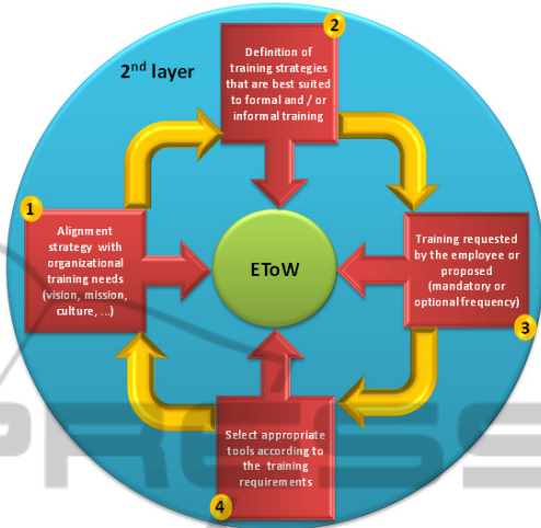
Figure 2: EToW model.

The model identifies and presents the relationships and interactions between the organizational strategy, the training needs of the employees, social tools, training strategies and their implications for practice and training in workplace.