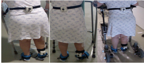
Figure 1: ADs used in this study. Left image: Crutches; centre image: standard walker; and right image: RFS ASBGo walker).

correspond to the medio-lateral (ML), vertical (V) and anterior-posterior (AP) accelerations, respectively.