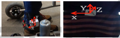
Figure 2: Description of the axis of the accelerometer at the right ankle (left image) and at the trunk (right image).