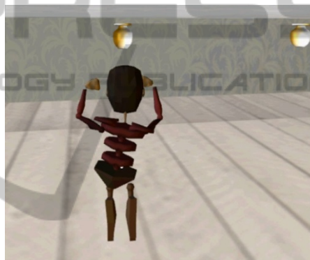
Figure 6: Collecting items in the room.

Also the interface gave some challenges. To start with the participants had some problems moving around in a 3D environment. However, they seemed to learn pretty fast, although some of them moved too much around on the floor and ended up too close to the camera. One participant even wanted to move around in the 3D environment to search for the key, and the others wanted to stay in the game garden after the game was over. We think this shows that the players liked the 3D environment. Maybe this environment gives the game more life and in particular makes the game environment more similar to real life? We feel that a 3D exergame can be further investigated for this target group.