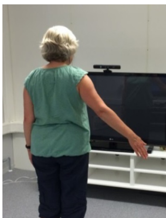
Figure 2: The pause pose.

To start the game, both arms should be lifted as shown in figure 1. A pause pose is implemented, and this is the standard pause pose for Kinect™ – i.e. the arm is held in 45 degrees from the body. This is shown in figure 2.