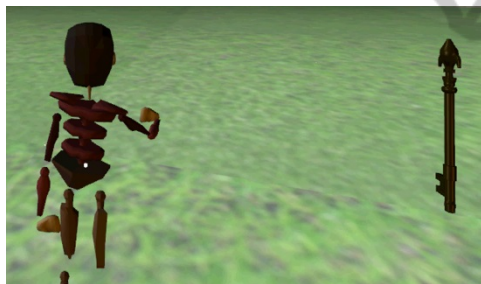
Figure 5: The avatar and the key in the lab test version.

Also the lab test was performed in single player mode since adding remote players would make the game more confusing, and we wanted to test how they reacted to the 3D game environment.