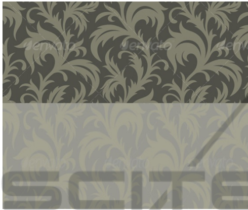
Figure 4: The walls in the room before (top) and after changes. Also here the users found the pattern too dark and disturbing.