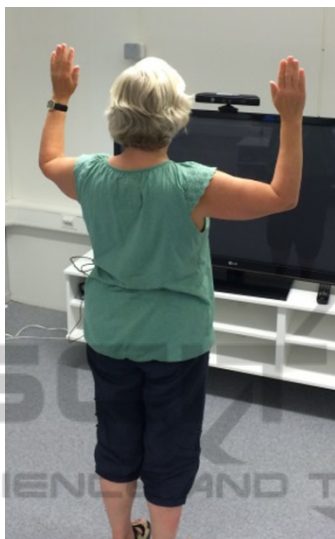
Figure 1: The start pose.

rendering of the data was handled in any WebGL capable web browser by a WebGL wrapper called Three.js, which was then displayed via HTML5. These coupled with the Kinect SDK and OpenNI to gather the joint data of the users made up the full list of the main technologies used.