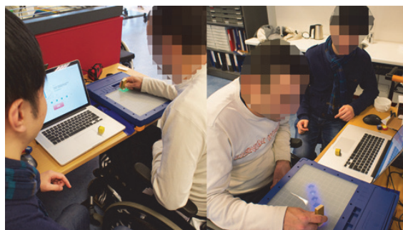
Figure 1: A patient and therapist using TagTrainer in arm-hand rehabilitation therapy.

TagTrainer (Tetteroo, 2013) is a technology for arm-hand training in stroke rehabilitation. It allows patients to manipulate physical objects (e.g. lift, place, rotate) on one or more interactive tabletop surfaces – called 'TagTiles' – that are connected to a computer. TagTrainer allows therapists to use objects of daily life for rehabilitation training, since the TagTiles are able to detect the presence, position and orientation of these objects as long as these are tagged appropriately with RFID tags. TagTrainer guides patients through an exercise by lighting up areas on the TagTile boards where objects have to be placed, moved or picked up from. Furthermore, the system provides both written and spoken instructions. Finally, TagTrainer collects quantitative performance data (e.g. speed of execution, number of repetitions) through the RFID sensors in the TagTile boards, as well as qualitative performance data (torso compensation, shoulder compensation, accuracy of object placement on the TagTile boards) through the RFID sensors in the board and accelerometers attached to the patient's torso and shoulders.