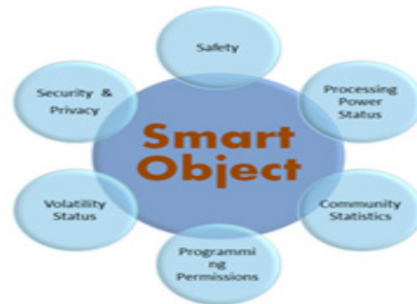
Figure 1: Smart Object Standardization Handlers.

One solution to address the above mentioned challenges as mentioned earlier in the introduction section, is to standardize a smart object (SO) with handlers that can address key quality issues as shown in Figure 1. These standards can guarantee a controlled open platform that developers can use. The developer need not only know how to program the smart object, in case its interface is available for any programmer, but needs to know also extra