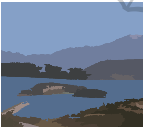
Figure 1: High resolution image segmentation with the single detected sky region. The algorithm has merged the regions that were not smooth, creating a single region for the sky. The skyline can then be easily extracted to be used for image registration and produce the final result.

To provide the above functionalities and visualizations, various algorithms have been implemented. The system implementation stores the images and the semantic maps in a relational database (Christodoulakis et al. , 2009) and provides retrieval functionality for both. The maps are acquired from a semantic map server and can be personalized according to user interests. For example, if the user is interested in the archaeological or cultural sites of Crete but not in its geographic features, the server can then provide a version of the map of Crete without the geographic semantic objects. Ontologies play an important role in our system. The system is interactive and the user can add its personal ontology tree where ontologies have a number of semantic types and semantic objects belong to these types, forming a hierarchy.