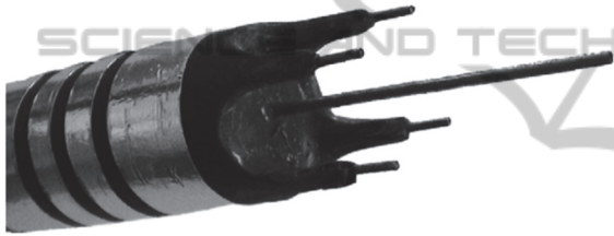
Figure 3: Multi-functional probe (Valente, 2006).

Figure 3 shows the MFP probe before installation.