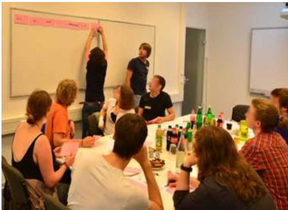
Figure 1: Focus Group on Mobility Demands.

A focus group study is an explorative method to gather broad and detailed data on a certain topic from a limited number of participants. It is used in early stages of research to identify aspects of the research question that are relevant to users. It does not provide statistically relevant data due to its qualitative nature but serves as a pre-study for the quantitative follow-up study.